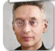
Saint Titus Brandsma Dutch Carmelite friar

Ten new Saints were canonized by Pope Francis on Sunday, May 15, 2022. You can read their stories here or to learn more, visit the Vatican website: 20220515-libretto-canonizzazione.pdf (vatican.va) .