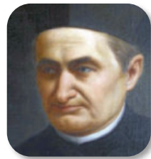
Saint Luigi Maria Palazzolo

Saint Marie Rivier Presentation of Mary founded the Sisters of the Presentation of Mary in 1796 during the French Revolution, when many Catholic convents were closed and religious activities outlawed. Despite the cruel environment of the Revolution, the order, which focused on the Christian education of youth, flourished.