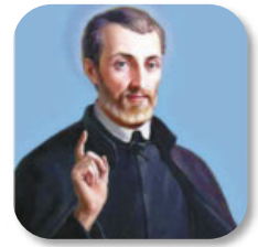
Saint Cesar de Bus