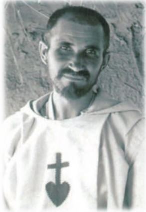
CHARLES DE FOUCAULD (1858-1916)

Page 4 | Sunday, May 29, 2022 | The Ascension of the Lord